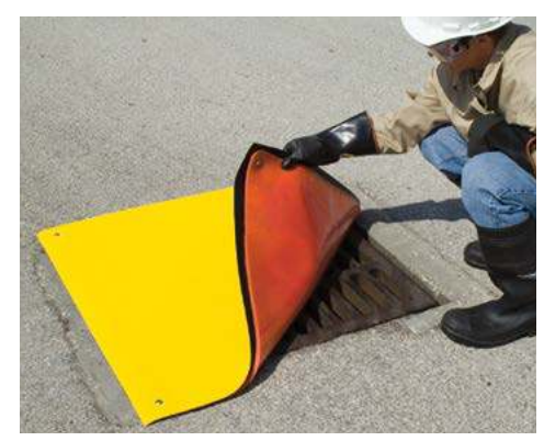
Ultra-Drain Seal Plus helps seal off drains to minimize problems!

* Will cause the Ultra-Drain Seal™ to swell temporarily but not degrade.