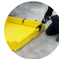
Mini Foam Wall