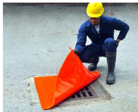
Ultra-Drain Seal helps seal off drains to minimize problems!

* Will cause the Ultra-Drain Seal™ to swell temporarily but not degrade.