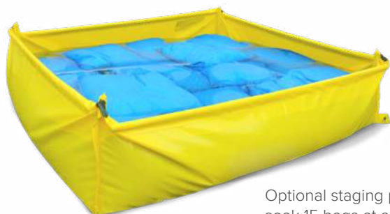
Optional staging pool can soak 15 bags at a time