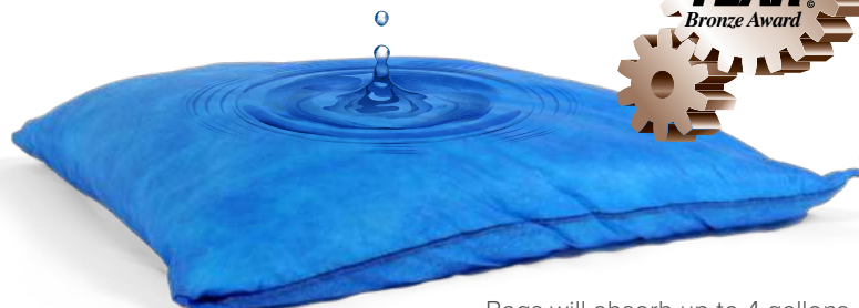
Bags will absorb up to 4 gallons (40 lb equivalent) in just minutes