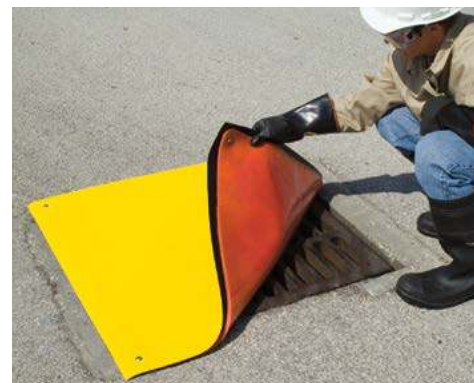
Ultra-Drain Seal Plus helps seal off drains to minimize problems!

* Will cause the Ultra-Drain Seal™ to swell temporarily but not degrade.