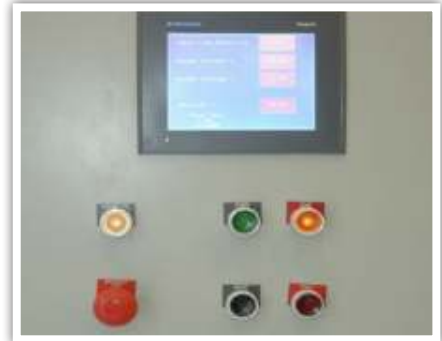
Encapsulation Control Unit (ECU)