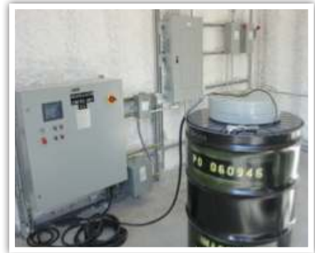
55-gallon model being encapsulated

A final option is to contract UltraTech to process the waste for you. The process requires very little space (less than 1000 ft 2 ), can be performed indoors or out, and can be done with minimal training.