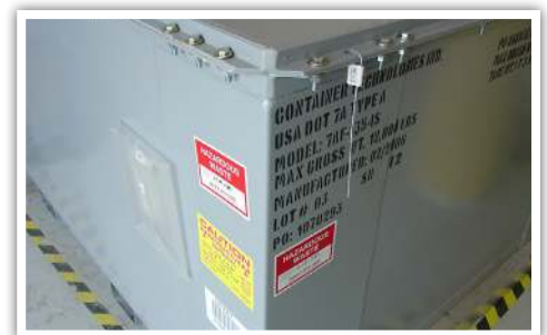
Complete Unit – Ready to Ship