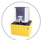
Ultra-IBC Spill Pallet