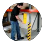
Ultra-Rack Protector Plus