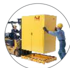
Ultra-Safety Cabinet Bladder System