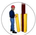
Ultra-I Beam Protector