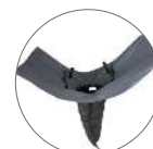
Ultra-Drain Guard, Heavy Metal Model