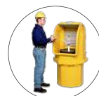
Ultra-Hard Top P1 Plus