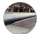
Ultra-Trench Filter Boom