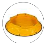
Ultra-Pop Up Pool