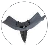
Ultra-Drain Guard, Heavy Metal Model