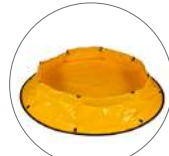
Ultra-Pop Up Pool