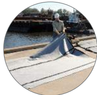
Ultra-Oil Filter Boom, Skirted Model