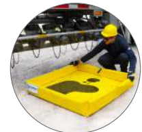
Ultra-Containment Berm, Mini Foam Wall