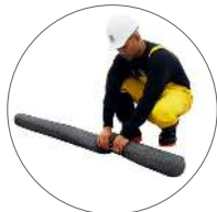
Ultra-Oil Filter Boom