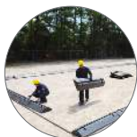
Ultra-Containment Berm, Modular Model