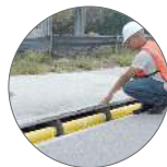
Ultra-Curb Guard Plus