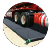
Ultra-Containment Berm, Foam Wall Model