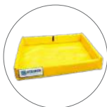
Ultra-Mini Foam Wall Berm