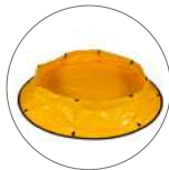
Ultra-Pop Up Pool