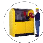
Ultra-Hard Top Plus