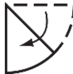
Figure 1 C.