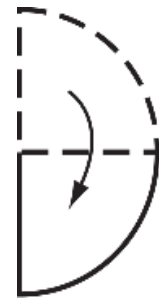
Figure 1 B.