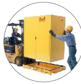
Ultra-Safety Cabinet Bladder System