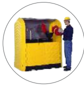
Ultra-Hard Top Plus