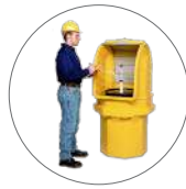
Ultra-Hard Top P1 Plus