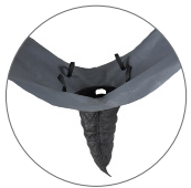
Ultra-Drain Guard, Heavy Metal Model