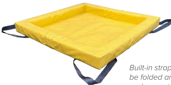
Built-in straps allow berms to be folded and hung for quick and easy storage.