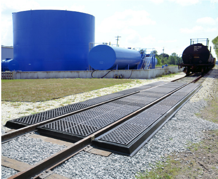
System shown includes one Center Pan (Part# 7200) and two Side Pans (Part# 7210)