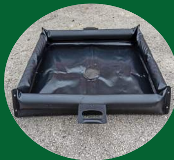
Built-in handles help with handling/positioning