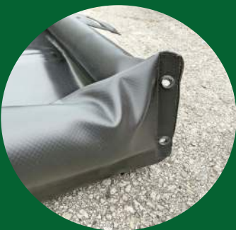
Corners can be tied down for added security